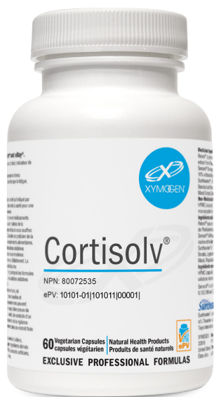
Available in 60 vegetarian capsules