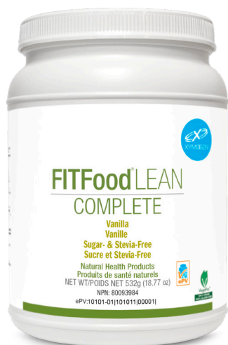
Available in Vanilla